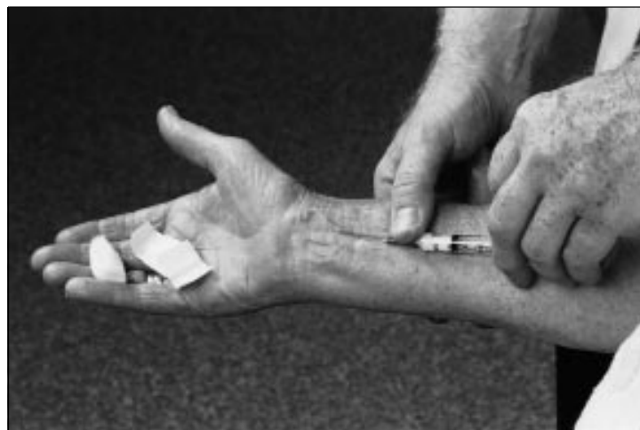
Fig 1 Site for injecting corticosteroid to treat carpal tunnel syndrome

The participants were patients referred to the Medical Centre Alkmaar with signs and symptoms of the carpal tunnel syndrome of more than 3 months' duration confirmed by electrophysiological tests. In those with bilateral symptoms, the arm with the most severe symptoms was chosen, and treatment of this arm was randomised. We excluded patients aged under 18 years or patients who had already been treated for symptoms of the carpal tunnel syndrome.