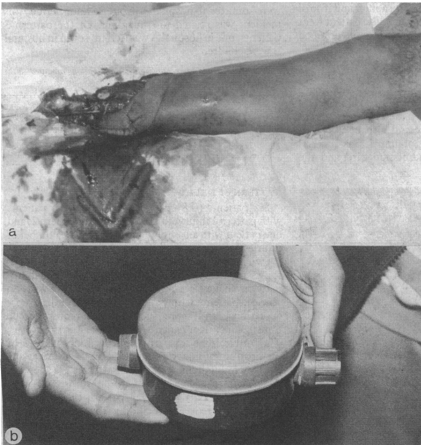
FIG 1—(a) Traumatic amputation of left foot and lower leg caused by (b) buried antipersonnel mine