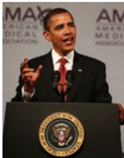
Obama told doctors to be healers not "bean counters"