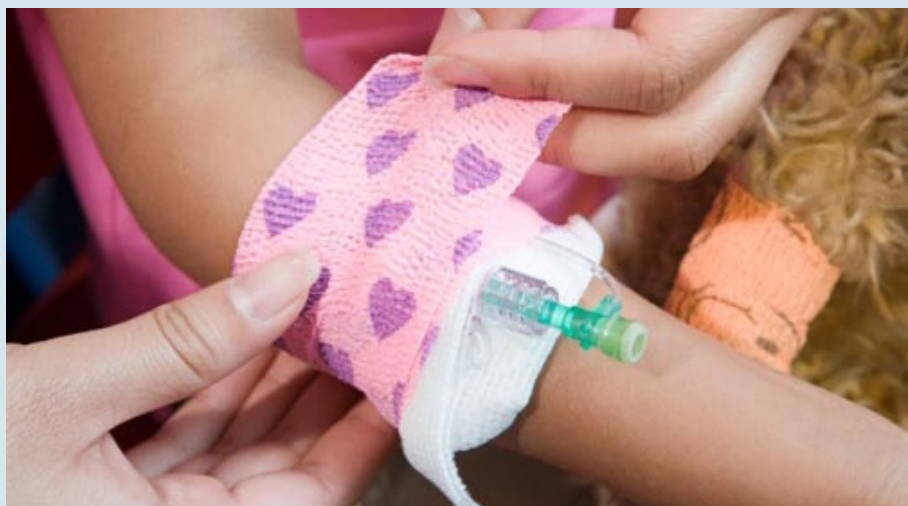
Out of 60 000 safety incidents among children in 2007-8 nearly one in five (17%) were drug related