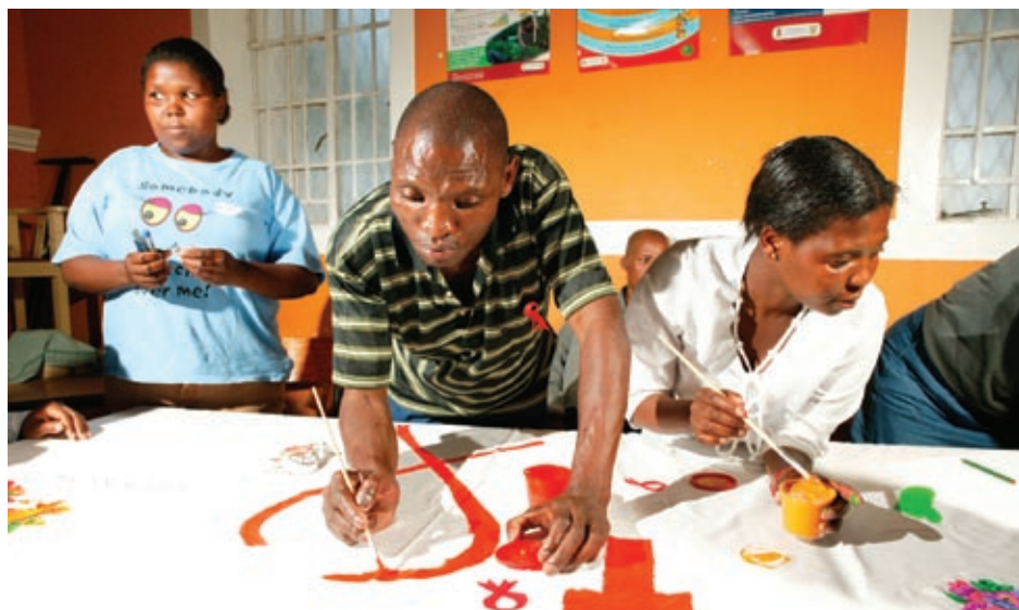
Awareness campaigns are thought to have contributed to the fall in HIV prevalence