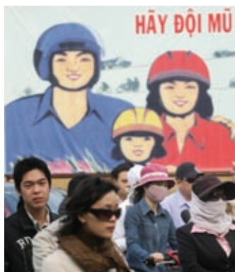
Road traffic accidents, p 1465