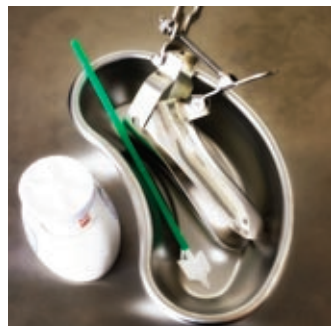
Cervical screening, p 1480