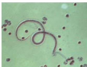
Lymphatic filariasis, p 1470