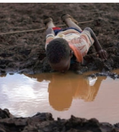
Famine threatens Horn of Africa, p 1466