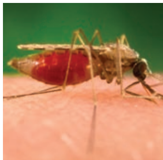
Aedes aegypti mosquito, p 1477