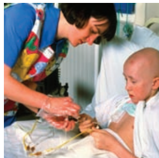
Leukaemia in children, p 1491