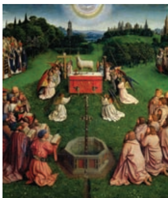
Medicine's sacrificial lamb, p 1503