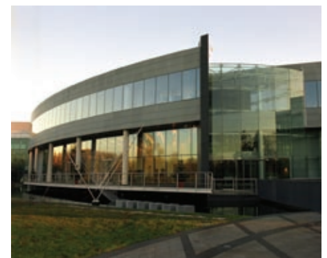
Students have been travelling to Pfizer's Surrey headquarters in Walton Oaks for seminars

Pfizer says that its experience with Brighton and Sussex has been successful.