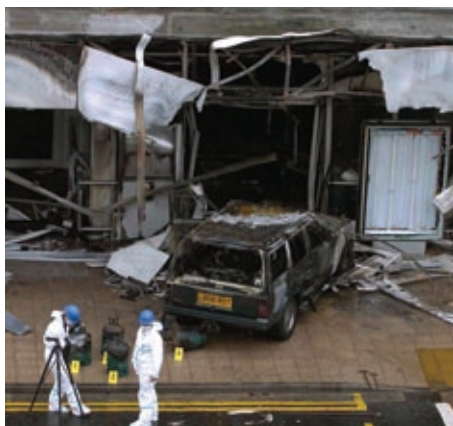
Glasgow airport after a car bomb attack in June 2007