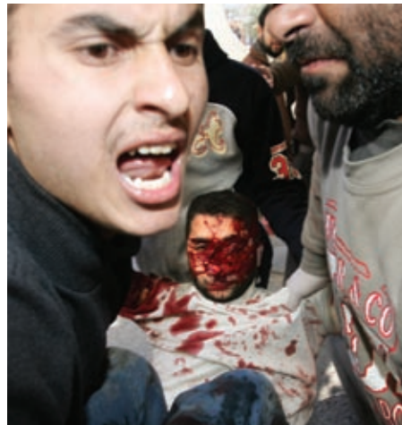
A wounded Palestinian is carried into hospital in Gaza City on 4 January

the emergency care they need," he said in a news conference on 6 January. He added, "Some people are dying because ambulances are not getting there in time. It's appalling."