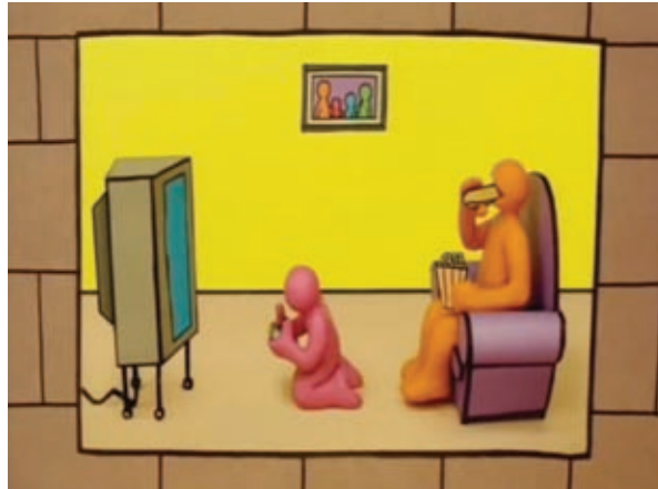
TV campaign highlights the need to change our sedentary lifestyle

She explained that the scale of obesity in the United Kingdom needs an ambitious and innovative approach. "We have adopted ideas from successful movements such as Make Poverty History and Comic Relief,