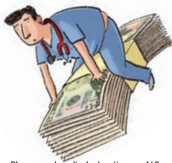
Pharma and medical education, pp 469, 484, 486, 487, 490