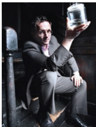
Blood and Guts, p 518