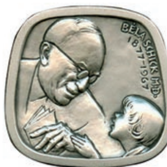
Bela Schick's classic aphorisms, p 521