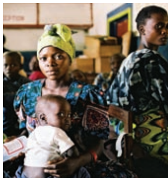
Reducing health inequalities, p 477