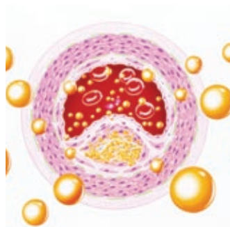
Hypercholesterolaemia, pp 503, 509, 510