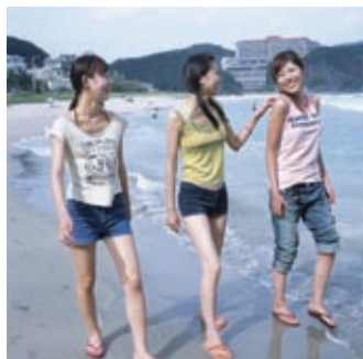
Do overweight children necessarily make overweight adults? p 500