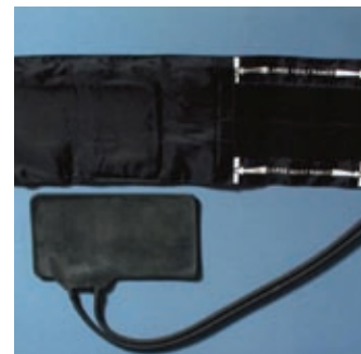
Lesson of the week: The trouble with blood pressure cuffs, p 515