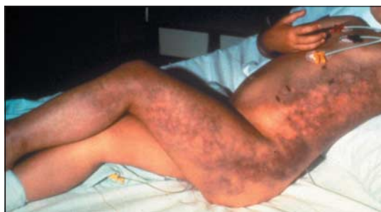
Fig 3 Generalised swelling and bruising of the whole body in an infant

Initial management is to reassure, give paracetamol to control pain, and immobilise the whole patient (especially the bitten limb with a splint or sling) during urgent transport to hospital. Early anaphylactoid symptoms can be treated with an oral or parenteral H 1 blocker or adrenaline (epinephrine) (Epi-Pen), depending on severity. Any interference with the wound should be avoided. Tourniquets, ligatures, and compression bandages should not be used.