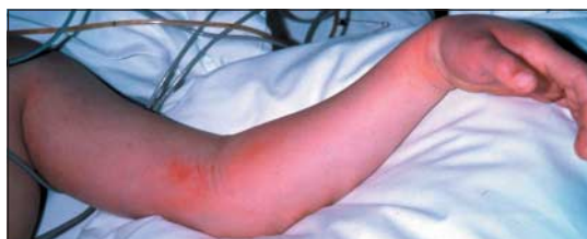
Fig 2 Extensive swelling of the bitten limb in a child, 24 hours after the bite, showing bruising

oedema, as well as the more focal angio-oedema that can lead to fatal occlusion of the upper airway, pulmonary oedema, w15 and cerebral oedema. Coma and seizures have been attributed to hypotension, cerebral oedema, hyponatraemia, hypoalbuminaemia, or hypoxaemia secondary to respiratory distress. 7 Cardiac arrest, acute gastric dilatation, paralytic ileus, and acute pancreatitis w16 are other reported complications.