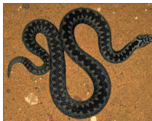
Fig 1 Adder or viper ( Vipera berus )

Local envenoming —Immediate sharp pain is followed, usually within a few minutes but sometimes up to more than 30 minutes later, by a sensation of tingling and local swelling that spreads proximally. Local blisters containing blood are uncommon. Spreading pain, tenderness, inflammation (often described misleadingly as "cellulitis," although there is no infection), and tender enlargement of regional lymph nodes are sometimes