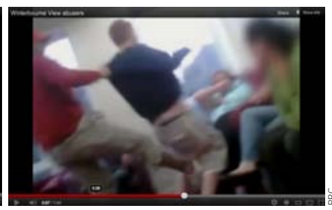
Stills from the Panorama investigation into Winterbourne View hospital: a case review report described the care provided there as a "horrifying picture of abuse"