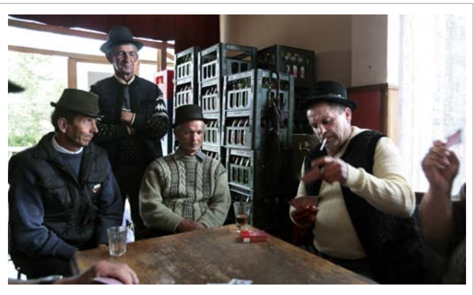
Men also seem to have adapted less well to the changes that have accompanied the upheavals in eastern Europe

Similarly, the opening of markets in eastern Europe, and the accompanying improvements in diet and subsequently cardiovascular deaths have benefited men disproportionately. <sup>19</sup> Nevertheless, cardiovascular disease still accounts for more deaths of men under 65 in eastern Europe