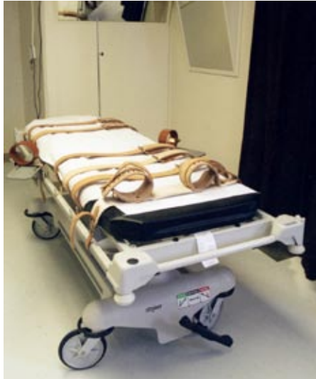
FLORIDA STATE CORRECTION DEPARTMENT

of drugs, and monitoring is done as humanely as possible? This could even be extended to finding a better combination of drugs. Possible drug options, drug combinations, and monitoring methods change as medical knowledge and practice develop. To this end, why shouldn’t clinicians with appropriate