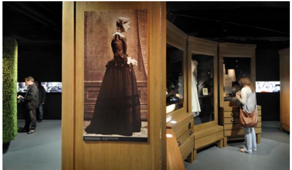
Ode to a Nightingale: the library-like "Reform and Inspire" pavilion

The new "pavilions" are inspired by Florence's innovative hospital design, in which cross ventilated wards were housed in separate buildings linked by corridors