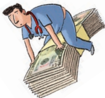
Pharma and medical education, pp 469, 484, 486, 487, 490